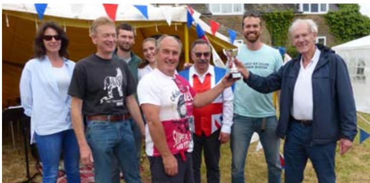
Lopen Queen's Platinum Jubilee Tug of War Champions 2022