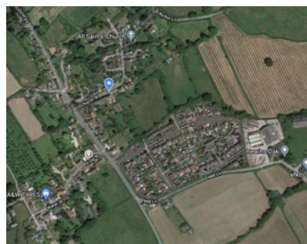
How it could evolve!

However upon deeper investigation it appears that the developer (Land Value Alliances - https://www.lva.co.uk/ ) also has options on the three fields that run across to Hewins Timber yard. Probably based upon the fact that the SSDC had, in the past, identified this site as 'suitable, available & achievable' for 48 dwellings (Planning History: 2011 HELAA).