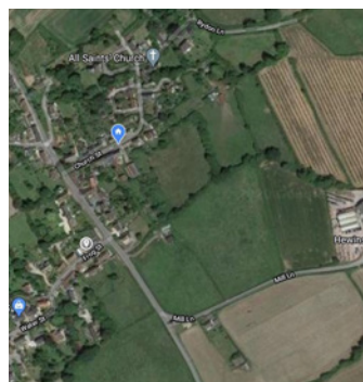
Greenfield site as is today.