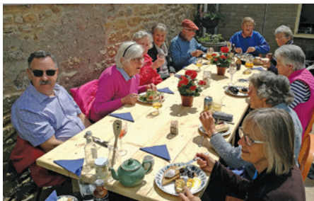
The May walkers enjoying lunch at The Feed Station in Merriott.