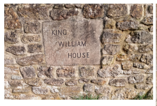
Recognise these? Read on...

The ale tasters would visit and judge how good the beer was and tax it accordingly!