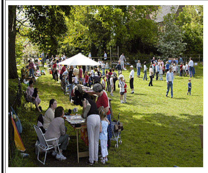
Sunday 30th August Details to follow.

Donations of plants for sale would be gratefully received at the Schoolroom on the Friday afternoon or between 9 and 10am on Saturday.