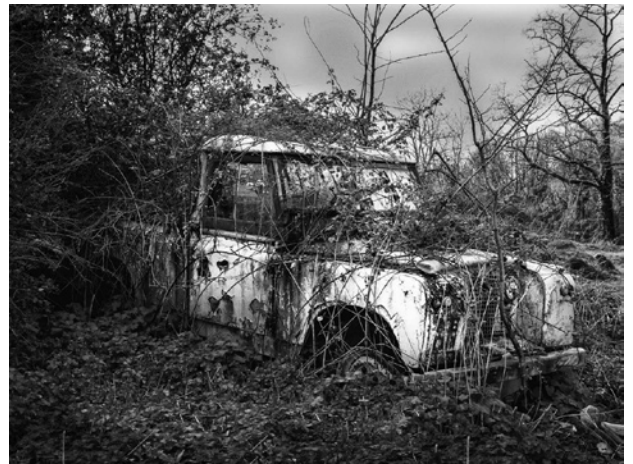
Winning caption - I only popped to the pub!