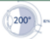
with optomap ultra-widefield retinal imaging

Introducing the New optomap ultra-wide field retinal imaging technology, giving us a comprehensive view of your eye health