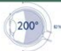
with optomap ultra-widefield retinal imaging

Introducing the New optomap ultra-wide field retinal imaging technology, giving us a comprehensive view of your eye health